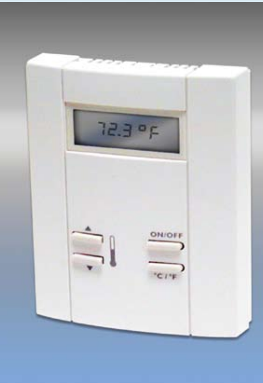
Andover Smart Sensor