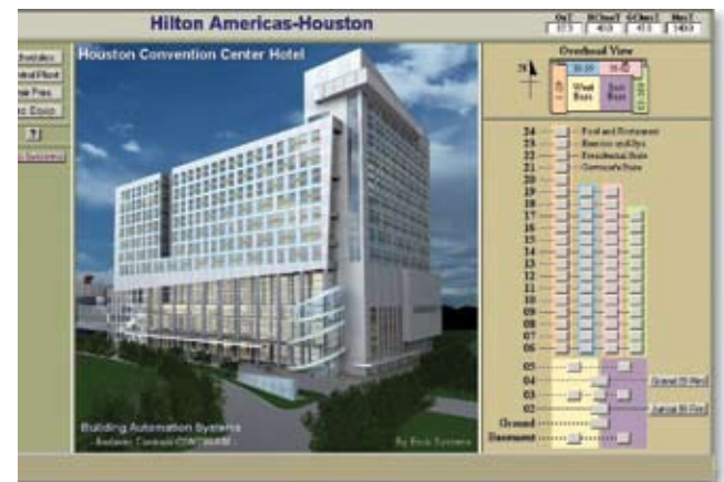
CyberStation workstation home screen